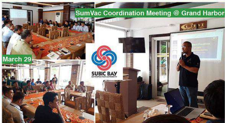
SumVac Coordination Meeting @ Grand Harbor