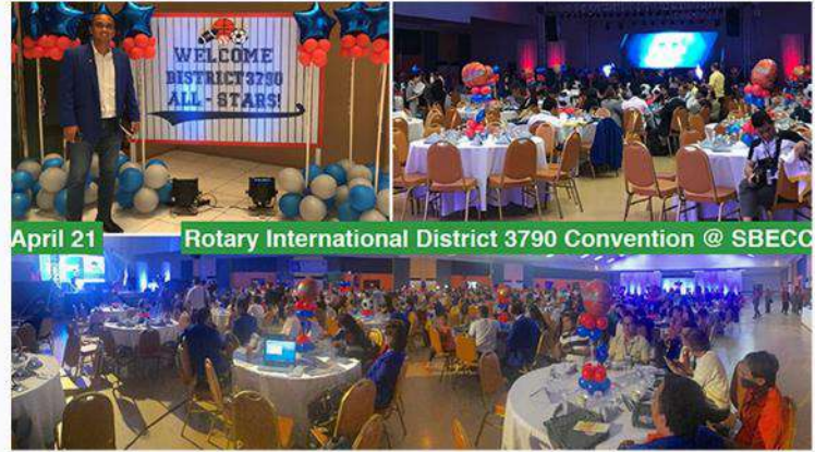
Rotary International District 3790 Convention @ SBECO