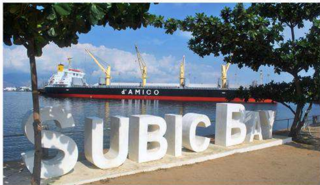
Cargo ships unload at the New Container Terminal and the Sattler Pier in the Subic Bay Freeport

SUBIC BAY FREEPORT — The Subic Bay Metropolitan Authority (SBMA) continues to generate positive revenue figures this year, recording a total of P615.28 million in earnings before interest, taxes, depreciation and amortization (EBITDA) in just the first four months of this year.