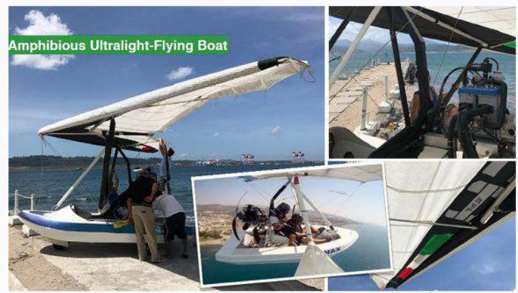
Amphibious Ultralight-Flying Boat